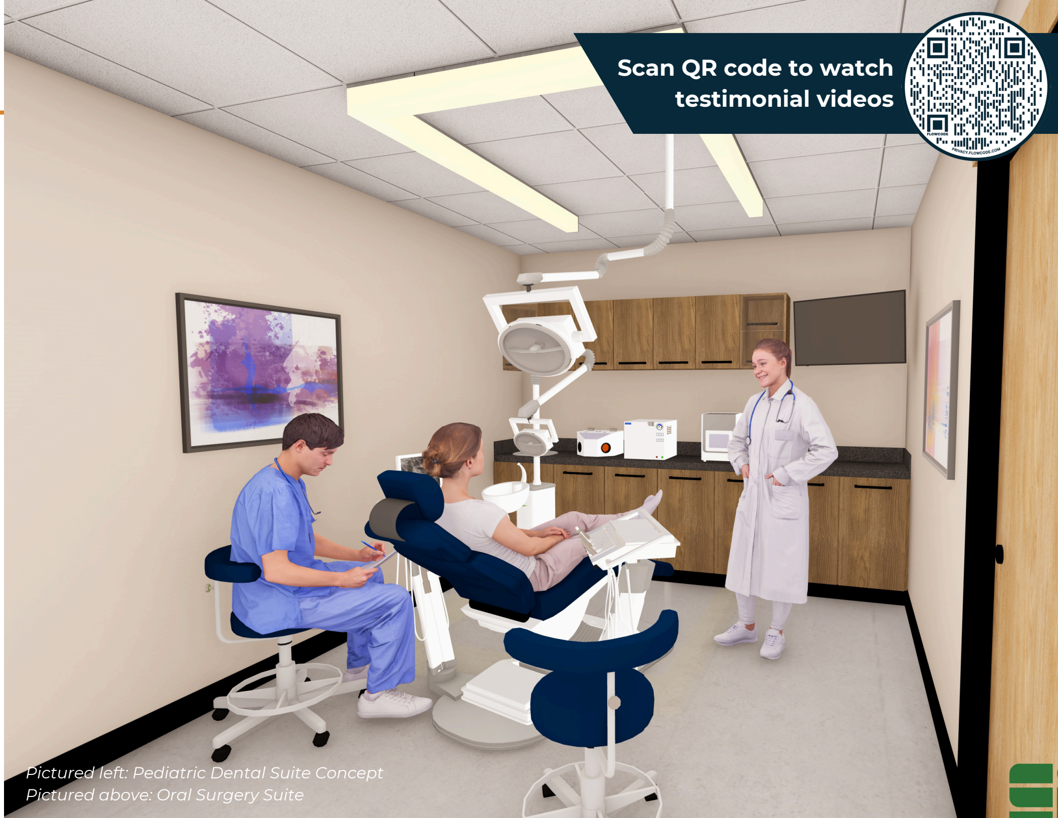
Pictured left: Pediatric Dental Suite Concept Pictured above: Oral Surgery Suite